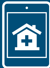
IoTastic HomeCare Application